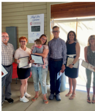
ADVOCATE APPRECIATION NIGHT