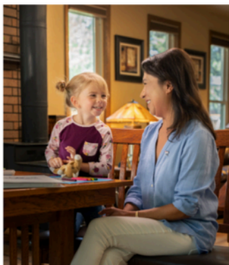
YEAR LONG EVENT SPONSOR